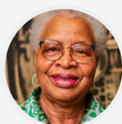
H.E Graça Machel